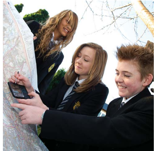
Discovering the world using GIS

This is a highly significant aspect of geography’s contribution to education. It enables us to ‘travel with a different view’ 1 .