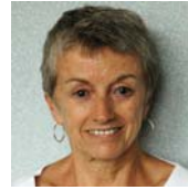
Professor Doreen Massey

‘What we need, it seems to me, is a global sense of the local, a global sense of place.’